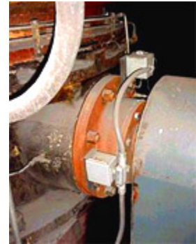
The photo above shows how SWAN sensors are placed for monitoring heavy equipment.

Stress Wave Analysis (SWAN™) technology easily identifies gear damage on machinery operating at low speeds as shown in the following rolling mill gearbox test. The rolling mill gearbox has an input pinion speed of 175 RPM and an output shaft speed of about 14 RPM. The input pinion gear has a 32 inch pitch diameter, and the output gear has a pitch of 16 feet. A previous diagnostic effort using vibration measurement had been unsuccessful, since the low speed and large mass of the machine resulted in extremely low level housing motion (vibration). However, measurement of the Stress Wave Energy (SWE) indicated that the input pinion bearing read more than ten times as high as the same type of bearing on the opposite end of the same shaft. Spectral Analysis indicated not only outer race damage to the suspect bearing, but also tooth damage on the input pinion gear. This gear tooth damage was also verified by visual inspection.